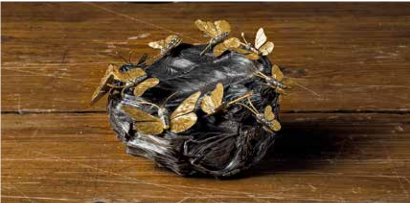
Ten Butterfly Box by Daniel Brush

L'ÉCOLE珠宝艺术学院同样致力于通过对公众开放免费的展览，提升公众对珠宝的鉴赏能力。展览通常与知名收藏家及当代艺术家展开合作，为公众提供一睹非凡的私人艺术品珍藏，并从中体悟珠宝艺术的多元面貌的难得机会。现场将设有专业的导览人员，并提供由珠宝历史学家、研究学者及其他专家亲自撰写的展览特别刊物。