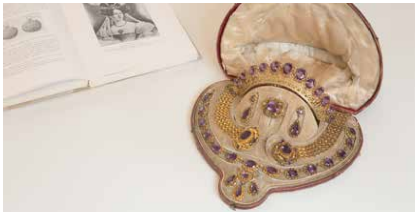
A History of Jewelry, from Louis XIV to Art Deco 一段珠宝历史：路易十四至装饰艺术时期

了解 Van Cleef & Arpels 梵克雅宝最为传奇的创意与非凡的作品，包括傲人的隐密式镶嵌技术 Mystery Set™, Zip 项链、Minaudière™ 百宝匣及 “Poetic Theaters” (诗意国度)。