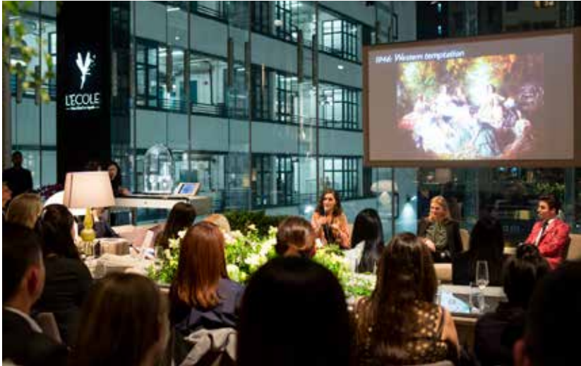
Evening Conversations 晚间讲座对谈

每场讲座均由两名珠宝专家倾情讲述，从不同角度探索有关珠宝诗意世界的不同主题。场场珠宝的盛会让学员与专家齐聚，展开对知识的热烈的互动与探讨。讲座对谈将于晚间举办，由鸡尾酒会揭开珠宝世界诗意的序幕。