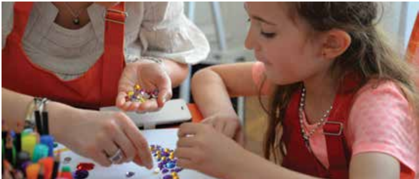
'Create Your Jewel' Workshop “制作你的珠宝” 工坊

参加课程及实践的青少年可以通过鉴赏宝石，或亲临宝石工匠的工作台，学习专业技巧，初探宝石及珠宝的诗意世界，了解其中的精髓与意义。