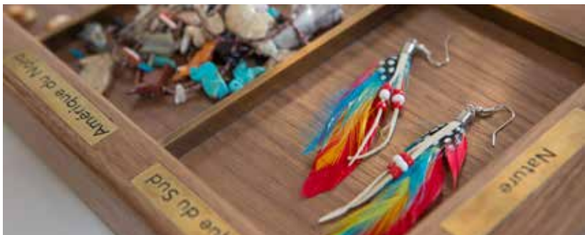
Amulets and Precious Symbols 护身符与珍贵象征

Learn about the Maison's most legendary inventions and creations including the Mystery Set™, Zip necklace, Minaudière™ precious case and 'Poetic Theaters'.