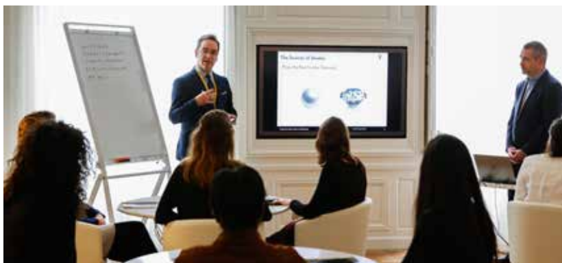
Art History of Jewelry 珠宝与艺术史