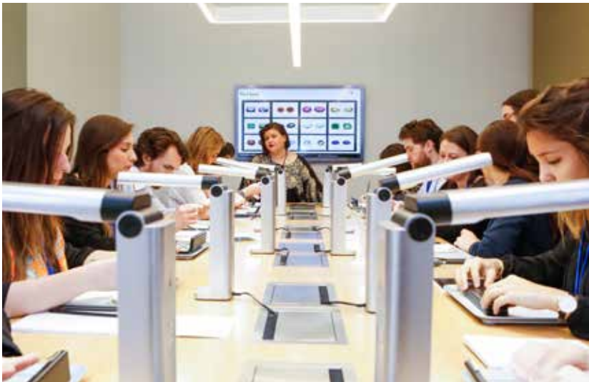
Gemology workshop L'ÉCOLE, School of Jewelry Arts, Paris

探索钻石的奥秘，了解其非凡特性、不同寻常的由来以及无坚不摧的硬度，还可以通过色泽为钻石分出等级并评定其净度。