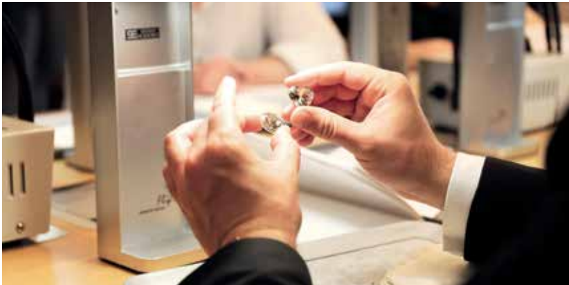
Discover the Gemstones 探索宝石的世界

Discover the secrets of this gemstone, from its uncommon properties and improbable birth to its unequalled hardness. Experiment classifying diamonds by color and assessing their clarity.