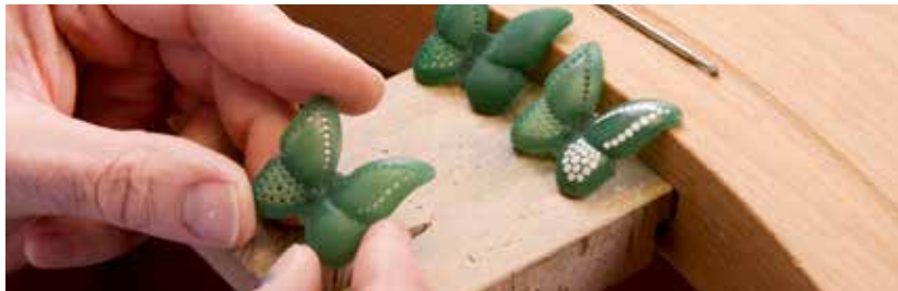
From the Wax Project to the Setting Techniques 从蜡模雕刻到镶嵌技术

探索珠宝设计师如何利用色彩的变换及组合，呈现宝石的形状和色泽，使得宝石跃然纸上，活灵活现。