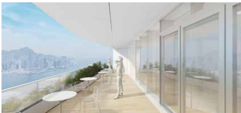
Terrace L'ÉCOLE, School of Jewelry Arts, Hong Kong