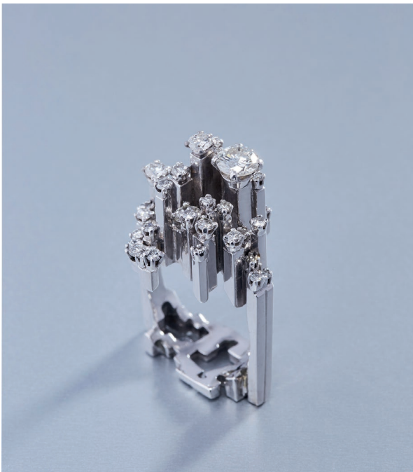
Jean Vendome, 5th Avenue Ring , white gold and diamonds, 1966

Exhibition from October 8 to December 18, 2020