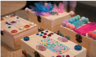
Make your own Treasure Chest (8 - 12 years old) ^