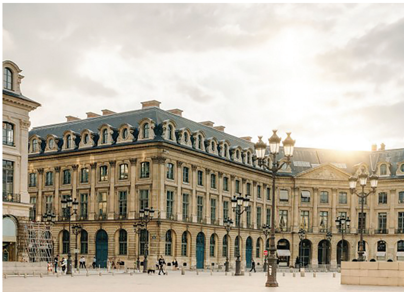
Place Vendôme, Paris