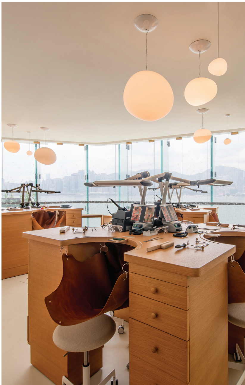
Jewelry Atelier L'ÉCOLE Asia Pacific, Hong Kong