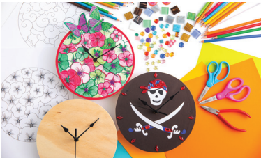
Make your own Precious Clock (8 - 12 years old) ^