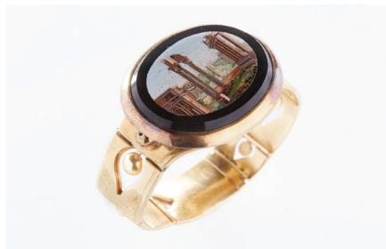
Micro-mosaic bracelet, circa 19th century 微型馬賽克手鐲，約19世紀

講師團隊包括60位來自不同範疇的國際專家：珠寶匠、珠寶藝術史學家、寶石切割師、寶石學家、日式漆藝工匠及「大明火」琺瑯專家。在課程中，學員能在數小時間親身體驗引人入勝的珠寶世界，並與充滿教學熱誠的講師互相交流。