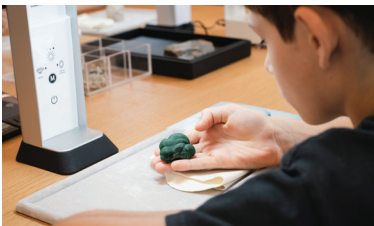
Discovering the World of Gems (13 - 17 years old)