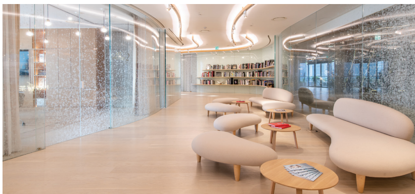
Library and Lounge