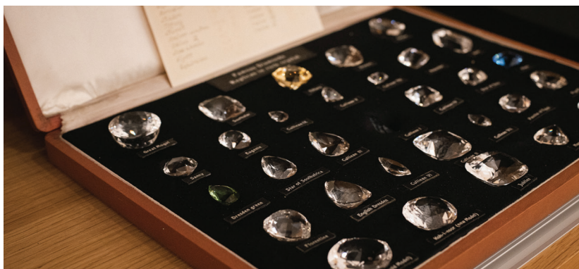
The Universe of Gemstones