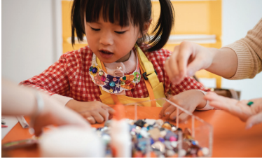
Create your Jewel (5 - 8 years old) *