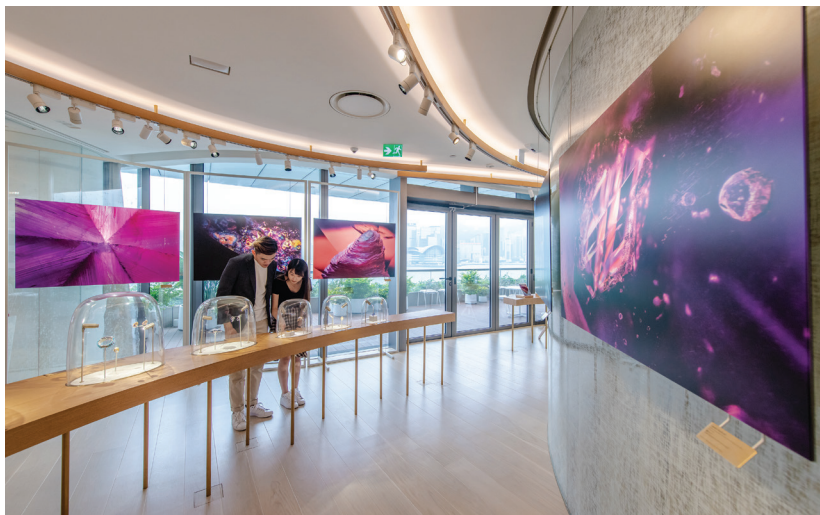
“Discover the Gemstones, Ruby & Sapphire” Exhibition, June 2020 「探索寶石世界：紅寶石與藍寶石」展覽，2020年6月

L'ÉCOLE 珠寶藝術學院亦提倡透過免費公眾展覽，提升公眾對珠寶的鑑賞能力。展覽與收藏家及當代藝術家合辦，提供難能可貴的機會讓公眾一睹非凡的私人藝術珍藏，從中領會珠寶藝術的多元面貌。現場設有導覽團，以及由藝術歷史學家、研究學者及其他專家親撰的展覽場刊。