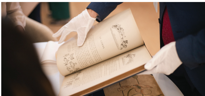
Art History of Jewelry