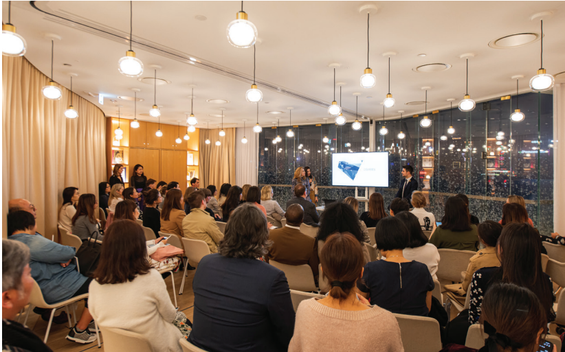
"New York Architecture & Art Deco Jewelry" Conversation, January 2020 「紐約建築與裝飾藝術珠寶」講座，2020年1月

每場講座對談均由兩名專家帶領，從不同角度探索有關珠寶世界的特定主題。一場場盛會讓大家跟專家聚首一堂，上演你來我往的熱鬧互動。講座對談於晚間舉行，由香檳酒會揭開序幕。