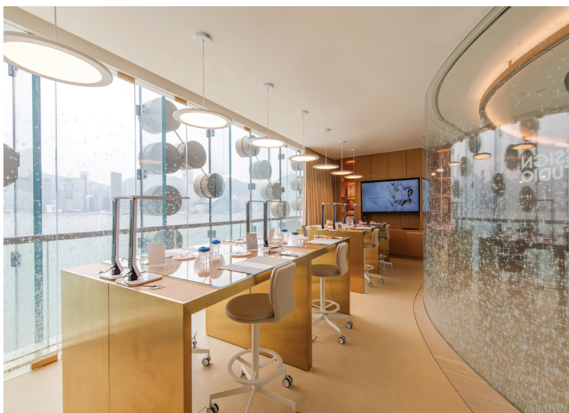
Design Studio L'ÉCOLE Asia Pacific, Hong Kong