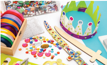
Crowns and Swords (5 - 8 years old) *