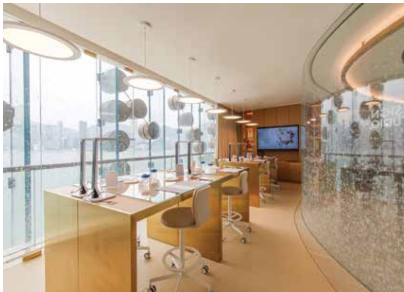
Design Studio L'ÉCOLE Asia Pacific, Hong Kong