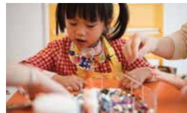
Create your Jewel (5 - 8 years old) * 制作你的珠宝 (5至8岁) *