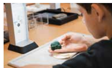
Discovering the World of Gems (13 - 17 years old) 初探宝石世界 (13至17岁)

* Accompaniment by an adult required 必需由一位成人陪同