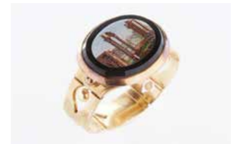
Micro-mosaic bracelet, circa 19th century 微型马赛克手镯, 约19世纪

学院的讲师团队包括60位来自不同领域的国际专家，包括：珠宝匠、珠宝艺术史学家、宝石切割师、宝石学家、日式漆艺工匠及「大明火」珐琅专家。在课程中，学员能在数小时亲历探索引人入胜的珠宝世界，并与充满教学热诚的讲师互相交流。