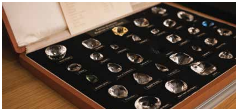
The Universe of Gemstones