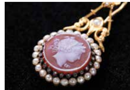
Around the World in Jewelry (Coming Soon)