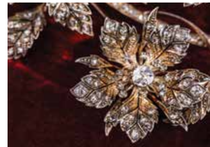
First Steps into the World of Jewelry 初探珠宝世界