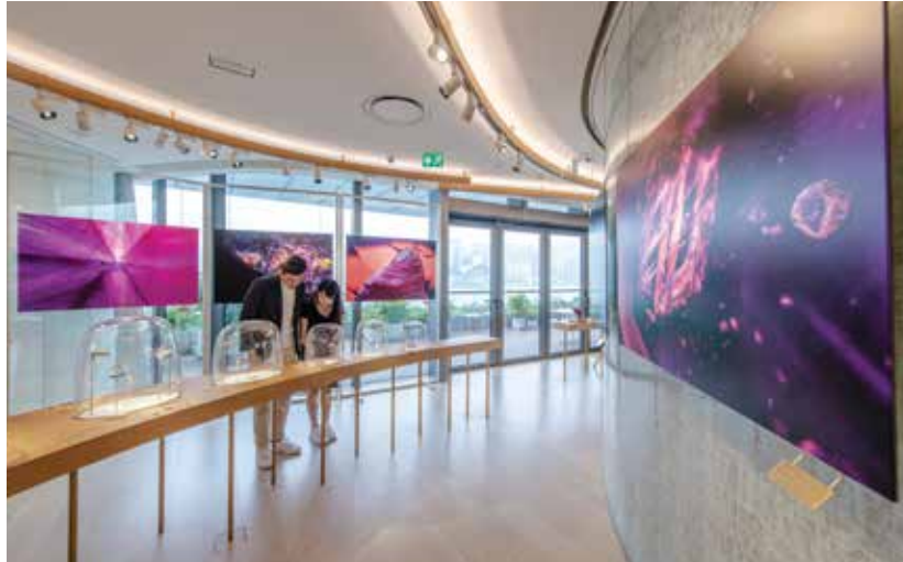
"Discover the Gemstones, Ruby & Sapphire" Exhibition, June 2020 「探索宝石世界：红宝石与蓝宝石」展览，2020年6月

L'ÉCOLE 珠宝艺术学院亦提倡透过免费向公众开放的展览，提升公众对珠宝的鉴赏能力。展览通常与收藏家及当代艺术家合作，为公众提供一睹非凡艺术品珍藏，并从中领悟珠宝艺术多元面貌的难得机会。现场设有导览员，以及由艺术史学家、研究学者及其他专家亲撰的展览特刊。