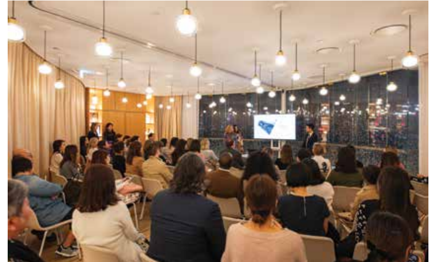
"New York Architecture & Art Deco Jewelry" Conversation, January 2020 「纽约建筑与装饰艺术珠宝」对谈，2020年1月

每场对谈讲座均由两名专家带领，从不同角度探讨有关珠宝世界的特定议题。一场场盛会让参加者跟专家齐聚一堂，展开与珠宝文化有关的互动讨论。讲座对谈于晚间举行，由香槟酒会揭开序幕。