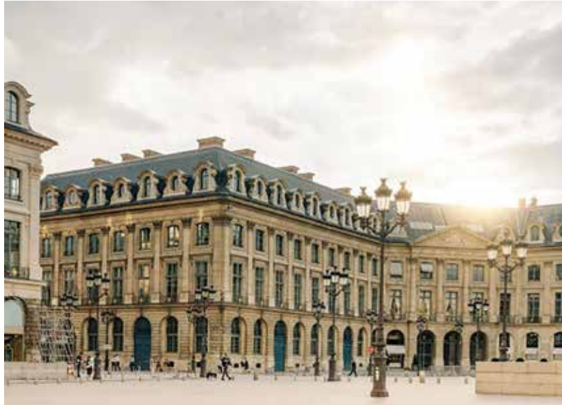
Place Vendôme, Paris