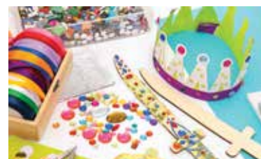
Crowns and Swords (5 - 8 years old) * 皇冠和剑 (5至8岁) *