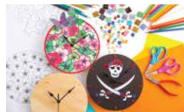
Make your own Precious Clock (8 - 12 years old) ^ 制作你的珍贵时钟 (8至12岁) ^