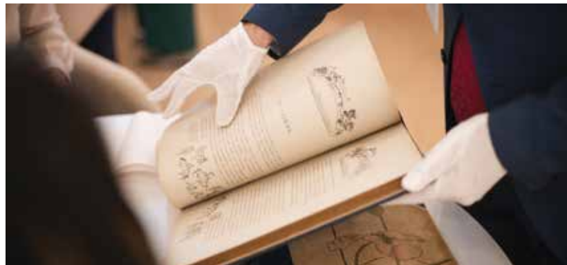
Art History of Jewelry