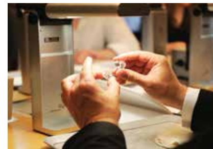
The Engagement Ring: History, Gemology and Know-How 关于订婚戒指：历史、宝石学及工艺

Silver, gold and diamond brooch, 19th century 银、金及钻石胸针，19世纪