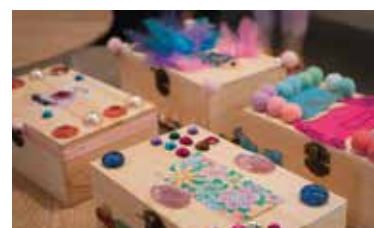
Make your own Treasure Chest (8 - 12 years old) ^ 制作你的珍宝箱 (8至12岁) ^