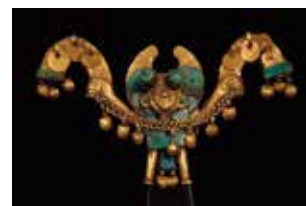
Nose ornament representing a man with rope, gold and turquoise, Moche Culture (100-800 CE)