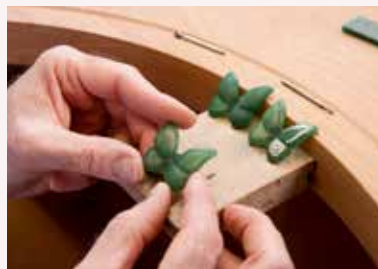
Course Du projet en cire aux techniques de serti