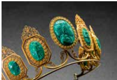
Tiara, pre 1806 Franz Kobek, Vienna Gold, malachite Museum of Decorative Arts in Prague

9am – 12pm: Private visit, before opening hours, of the Prague Museum of Decorative Arts and tour of the “Body and Jewel” exhibition, with the curator of the museum