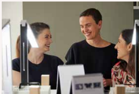
Course Diamond Grading

2:30 pm – 4:30 pm Workshop for ages 12 to 16: A la découverte du métier de dessinateur de bijoux