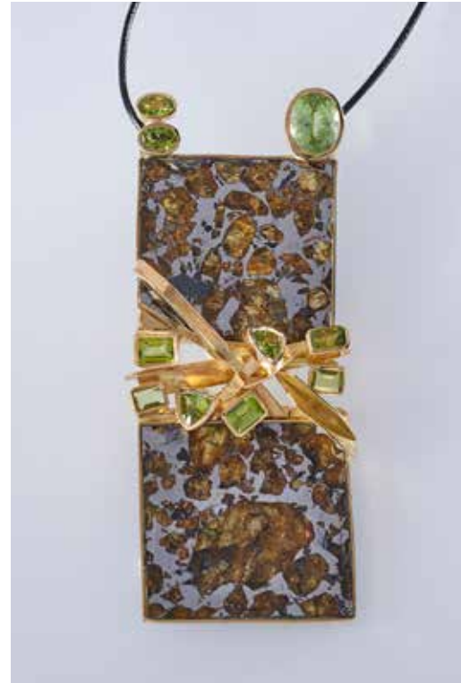
Jean Vendome Météor (Meteor) set of jewelry yellow gold, pallasite, peridots Private collection

Preconceived notion: all gemstones come from Earth False: The Meteor necklace, shown above, has two pieces of pallasite, a gem resulting from the collision of two celestial bodies.