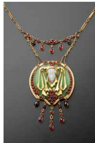
Josef Ladislav Némec (1871–1943) Necklace , before 1910, Gold, Bohemian garnets, chalcedony, glass, Museum of Decorative Arts in Prague