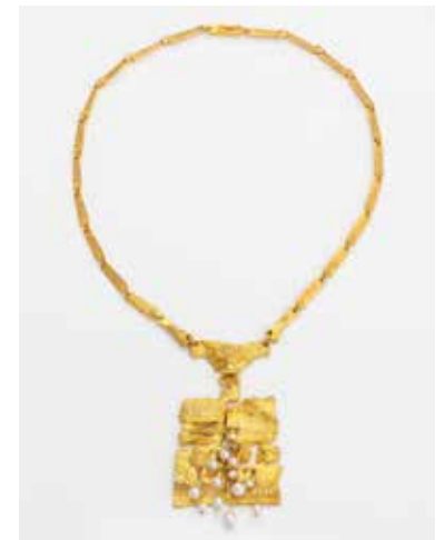
Björn Weckström Necklace 1969, yellow gold, pearls, Private Collection