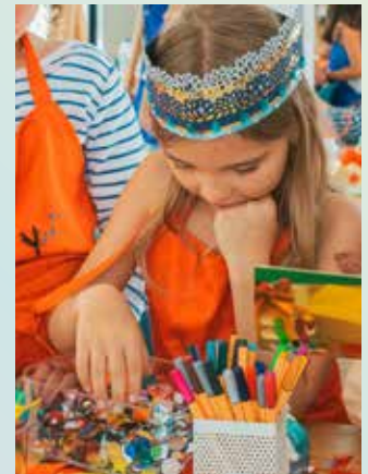
Course Crowns and Swords

Discovering the World of Gems (from ages 12 to 16) Wed. 26 th October