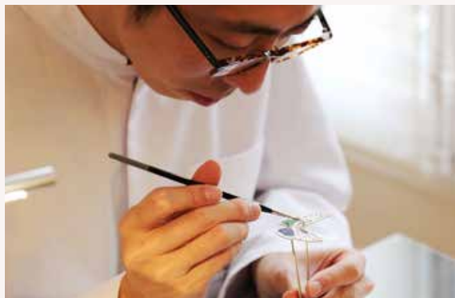
Course Jewelry and "Grand Feu" Enameling

9:00 am – 11:30 am The Engagement Ring: A Love Story