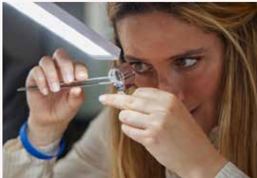
Course Diamond Grading