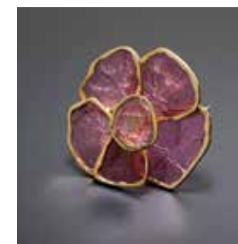
Jean Vendome Rose brooch 1974, yellow gold, tourmalines Private collection