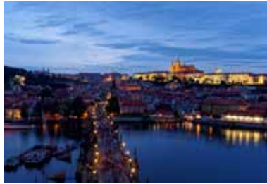
Evening view of Charles Bridge and Prague Castle from Old Town Bridge Tower

10am – 12:30pm: Immersion in the universe of a garnet workshop and cutting center: exchanges with the craftsmen who will help you discover all the stages of the creation of a piece, from the cutting of the gemstones to the final jewel