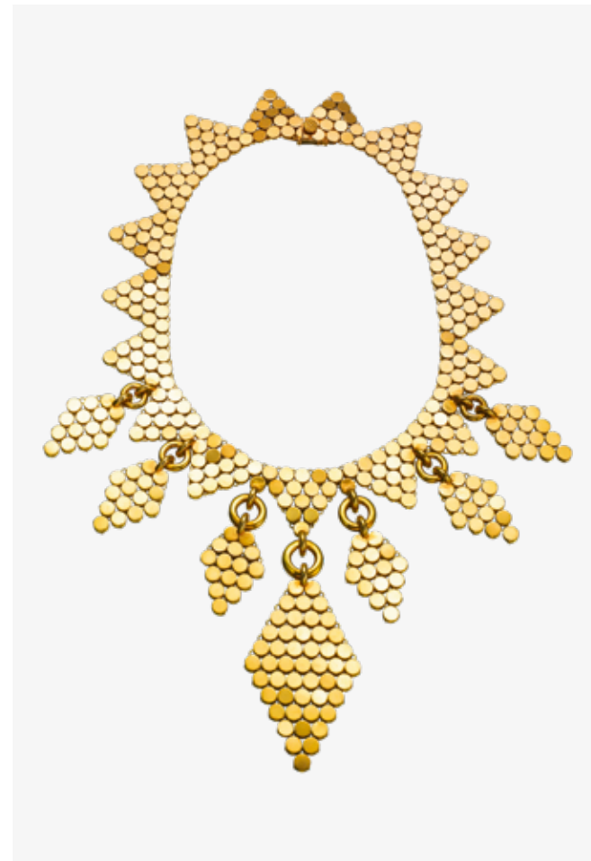
Van Cleef & Arpels Sequin necklace 1971, yellow gold Van Cleef & Arpels Collection