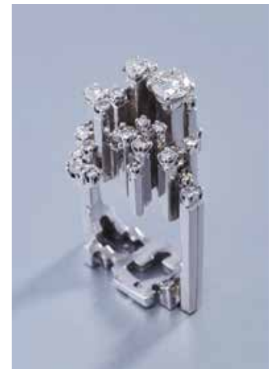
Jean Vendome Bague 5 th Avenue 1966, white gold and diamonds