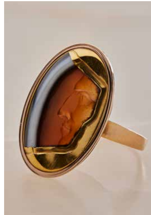
Rome? 18 th century Profile of a woman (Livia?) Sardonyx intaglio on a gold ring Guy Ladrière Collection

the top of the skull would have protruded from the oval ellipse, while the bottom of the intaglio would have left too much space for the rather receding chin. All indications are that this is a neoclassical copy rather than an original fragment mounted on a more recent ring. In the 18 th century, the taste for ancient cameos and intaglios led to the production of numerous copies and imitations; fragments also carried an aesthetic romanticism, spurred by the excavations of Herculaneum and Pompeii in the middle of the century. Similarly, the idea slowly spread that no civilization is impervious to downfall. The taste for ruins and for broken fragments led to a meditation on the passing of time. Perhaps only this poetry is everlasting.