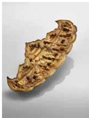
Hairpin with figures Ming Dynasty, 1368-1644, Mengdiexuan Collection