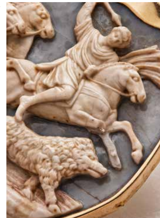
Italy(?) late 15 th century Wild boar hunt, after antique model Sardonyx cameo mounted on a badge Guy Ladrière Collection

The 15 th century marked the beginning of the Renaissance and the rediscovery of antique art. The scene on this cameo demonstrates this: it is a faithful copy of one of the medallions from the Arch of Constantine, built in Rome at the request of the Roman Senate in 312 to celebrate the victories of the emperor and the ten years of his reign. The monument itself exhibited various reused elements borrowed from older buildings. The medallion whose scene inspired this cameo comes from a building dating from the reign of Hadrian (177–138 AD) celebrating hunting, one of his favorite activities. Hadrian's face, however, has been carefully replaced with that of Constantine, to whose glory the 4 th -century triumphal arch was made. In addition to its testimony of the transposition of motifs from one support to another, this cameo bears witness to the tradition of “cyngetic” jewelry—works with elements and/or motifs related to the hunt. Probably intended to be mounted as a badge on the hat of a person attached to hunting and its history, this cameo also presents aesthetic qualities testifying to the mastery of Renaissance artists.