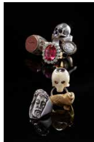
Group of rings Yves Gastou Collection