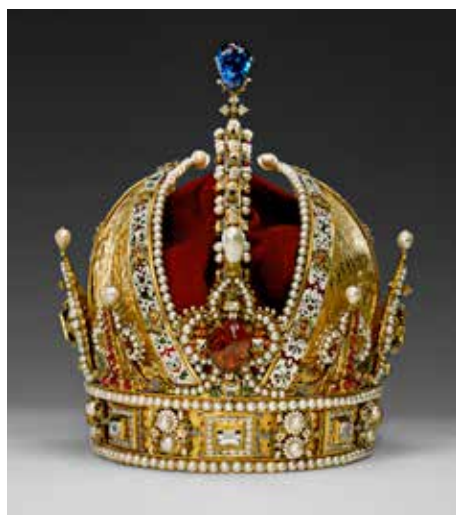
Jan Vermeyen Crown of the Emperor Rudolf II, 1602, Schatzkammer, KHM, Vienna

— This online conversation will be broadcast from L'ÉCOLE, School of Jewelry Arts in Paris.