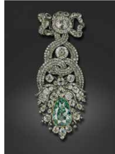
Dresden Green Diamond

9am – 12pm: Founded in 1723, the Green Vault is a “Treasure Museum”, unique in Europe for the richness and grandeur of its collections.