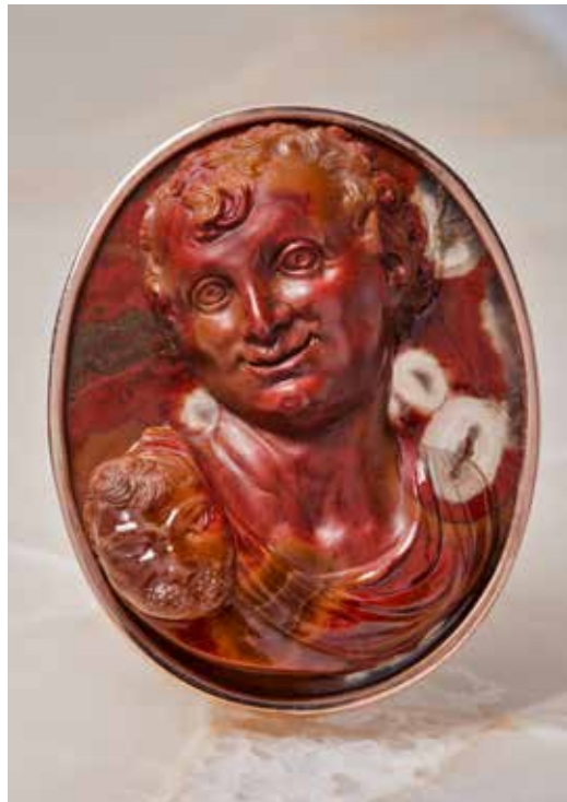
Northern Europe? 17 th century Fawn Jasper cameo on a gold pendant Guy Ladrière Collection

Moreover, the glowing color of the cheeks suggests an antique reference to Bacchus. In mythology, the fauns were part of the retinue of the god of the vine, of wine, of its associated excesses and of fertility. This cameo perfectly reflects the 16 th and 17 th century taste for antiquity.