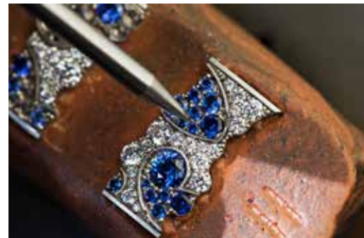
Grain setting of the «Lady Jour des Fleurs» bracelet 2015

Preconceived notion: A jewel is the work of a single artist False: The jewel is a collective work. The image above represents one of the steps in the creation of the jewel, the setting.